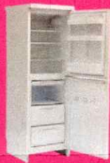
Fridges and freezers