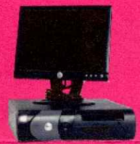
Computers and televisions