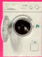
Washing machines and tumble dryers